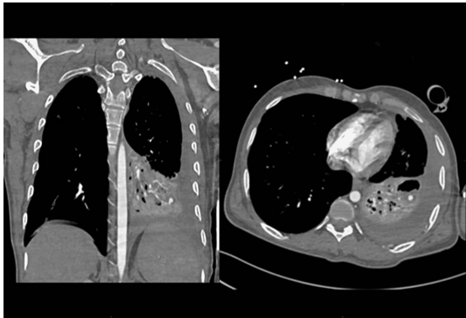
FIGURE 2: The CT pulmonary angiogram showing left lower lobe near complete collapse-consolidation with at least two cavitary lesions. Small pseudoaneurysm is noted measuring 5 x 6.6 x 5 mm arising from a subsegmental branch of the left lateral basal segmental artery of the left lower lobe adjacent to the cavitary lesion (Rasmussen aneurysm) in the background of pulmonary tuberculosis.

The interventional radiology team was consulted, and an angiography was performed on the left pulmonary artery, with a small pseudoaneurysm arising from one of the inferior segmental distal branches. Embolization was performed, and completion angiogram showed the disappearance of the pseudoaneurysm. The patient did not have any further episodes of hemoptysis or bleeding and was extubated two days later. He was then moved to a regular medical floor and was discharged a few days later on full anti-tuberculosis chemotherapy regimen.