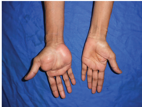
Fig. 1: Preoperative photograph of the giant palmar lipoma (note the extent of the lesion).

A 55 year old housewife presented with a one year history of an almost painless swelling over her right palm. She first noticed the swelling in the central aspect of her palm which gradually increased in size and over a period of one year, it has attained its present size. She had occasional pain while doing her daily activities and difficulty in holding any object. She had no tingling sensation or numbness over the palm or the fingers. On clinical examination, the swelling started from the wrist crease and involved both the thenar and the hypothenar region, extending up to the distal palmar crease (Figure 1). It also encroached into the first web space. On palpating the swelling, it was non-tender, soft and non-compressible with ill-defined margins and smooth surface. Patient was able to flex and extend her fingers and thumb without any restriction and there was no sensory loss. She already had a high resolution ultrasonography done for her swelling which was suggestive of lipoma. Our patient was poor and could not afford MRI scan. Hence, based on the clinical and radiological examination, we made a provisional diagnosis of lipoma and an excisional biopsy was planned.