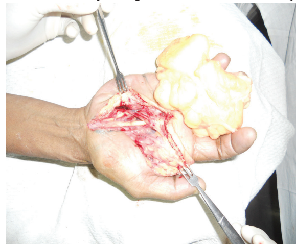
Fig. 3: Intraoperative photograph showing the tumor mass with preserved neurovascular structures and underlying tendons.

But in cases of lipomas, they can be of giant size without any malignant transformation. Deep