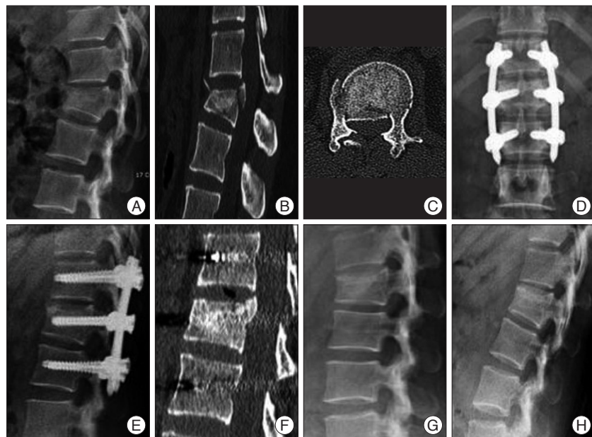
Fig. 2. A case of a neurologically intact 29-year-old woman with a L1 burst fracture (Group A). A, B, and C : Preoperative simple radiograph and computed tomography images showing about 40% height loss and 50% canal compromise. D, E, and F : Simple radiographs and a computed tomography image taken at 12 months after percutaneous screw fixation showing consolidation of the fractured body and improved kyphosis. G and H : Simple flexion and extension radiographs taken at 11 months after screws removal revealing well-maintained range of motion, which coincided with a completely pain free status.

bone fusion followed by screw removal after bone consolidation was found to have the advantages of early ambulation, minimizing tissue injury, and complete motion preservation regardless of