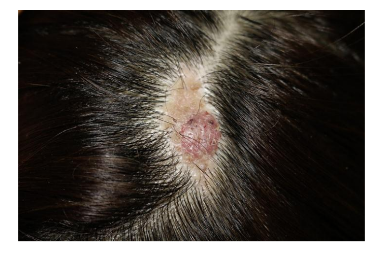
Fig. 1. Solitary erythematous, slightly verrucous nodule, 3 cm in diameter, arising on a yellowish, verrucous plaque measuring 3 × 6 cm on the left frontoparietal scalp.