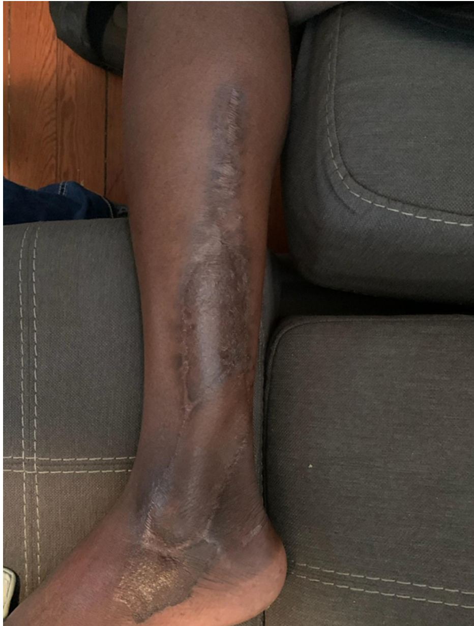
FIGURE 4: Follow-up picture showing complete healing and coverage of soft tissue defect