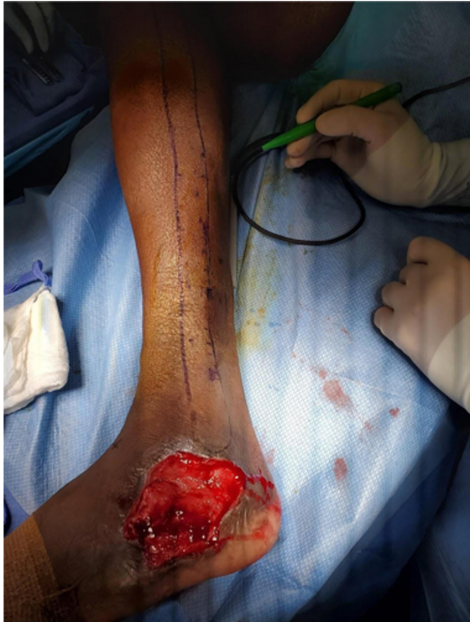
FIGURE 1: Lateral ankle and foot wound with arthrotomy

The defect and tissue laxity were analyzed. Although a posterior tibial perforator flap was considered, it was unlikely to reach in order to cover the defect. Doppler ultrasound was used to locate the perforators. The perforator flap was then marked over the perforators. Anterior incision was made, and peroneus muscles reflected anteriorly. Posterior incision following with perforators dissected out. Perfusion was then assessed. The flap was then transposed in to the defect. This peroneal perforator flap was designed to cover the arthrotomy and the remaining wound was skin grafted, including the proximal flap donor site (Figure 2).