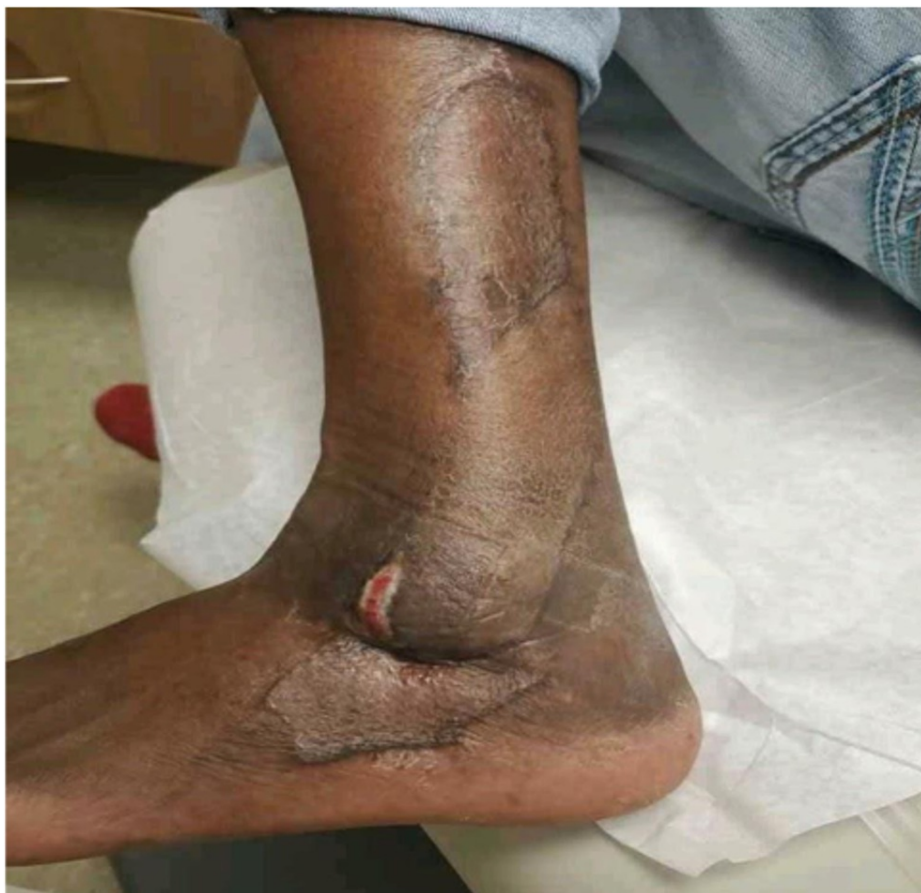
FIGURE 3: Partial-thickness loss of tip of perforator flap, managed with dressing changes

There was no formal dangling protocol postoperatively. The patient received culture-directed intravenous antibiotics postoperatively and began weight-bearing on schedule at the discretion of orthopedics. He did not require further orthopedic interventions (Figure 4).