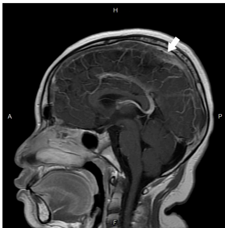
Figure 2. Magnetic resonance imaging with contrast revealed filling defect of the superior sagittal sinus (white arrow) that confirm the diagnosis of cerebral venous sinus thrombosis. A, anterior; P, posterior; H, head; F, foot.

Brain MRI with contrast further confirmed the diagnosis of venous sinus thrombosis in the superior sagittal sinus (Figure 2).