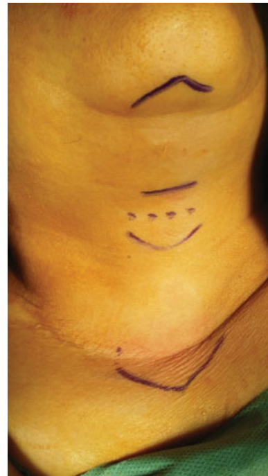
Fig. 1 Skin marks were lined over the mandibular margin, hyoid bone, thyroid notch and sternal notch.

The hyoid suspension procedure was performed under general anesthesia, with the patient in supine position with the neck extended. Skin marks were lined over the mandibular margin, hyoid bone, thyroid notch and sternal notch (► Fig. 1). The skin incision followed a horizontal skin crease between the body of the hyoid bone and the thyroid notch. The incision was carefully extended through the subcutaneous tissue and platysma muscle, as the muscle is less defined in the midline. Upper and lower subplatysmal flaps were elevated to expose the strap muscles, which were separated in the midline. The plane of the thyroid cartilage and the surface of the hyoid bone were exposed and the thyrohyoid membrane was clearly defined (► Fig. 2). Vicryl 0 was wrapped around the body of the hyoid bone