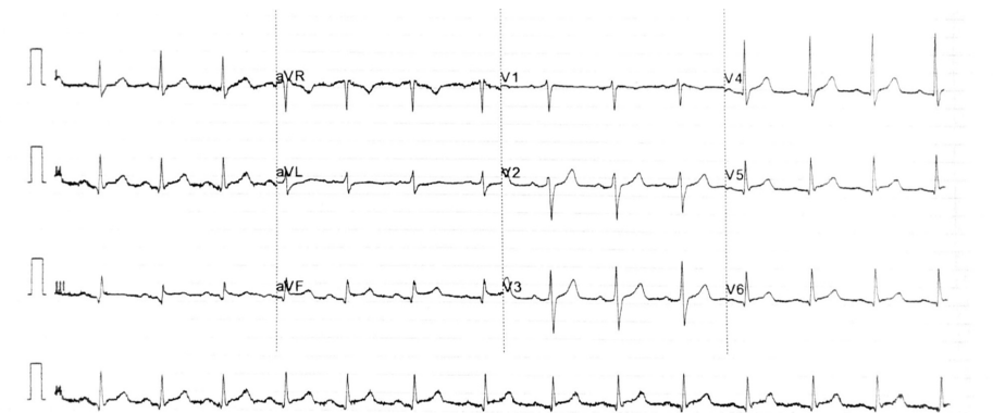
FIGURE 3: Post thrombolysis 12-lead ECG

Bedside echocardiogram revealed severe left ventricular (LV) systolic dysfunction (left ventricular ejection fraction (LVEF) 32%) with hypokinetic inferior and lateral walls. His troponin was 482 ng/L which peaked up to 584 ng/L after six hours of chest pain. Post thrombolysis ECG showed more than 50% reduction in ST-segment elevation (Figure 3). Also, the patient improved clinically. His blood tests were improving and the echocardiogram on discharge showed good bi-ventricular systolic function with no significant regional wall motion abnormality.