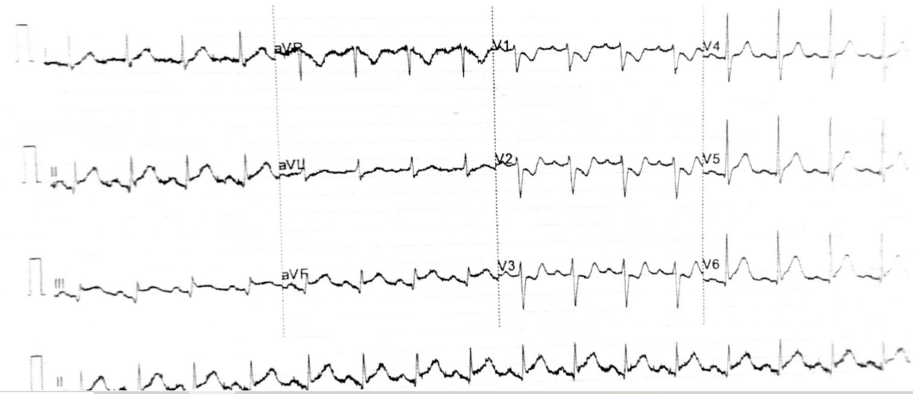
FIGURE 2: 12-lead ECG of the patient taken during chest pain

On the third day of admission, the patient acutely developed retrosternal chest pain radiating to his neck and arm with ECG findings consistent with STEMI in the infero-posterior leads (Figure 2). Shortly the patient had pulsed ventricular tachycardia (VT) followed by primary ventricular fibrillation (VF) arrest which was successfully cardioverted with a single unsynchronized 360 J. He had further episodes of pulseless VT for which a cycle of cardiopulmonary resuscitation (CPR) was given before return of spontaneous circulation (ROSC).