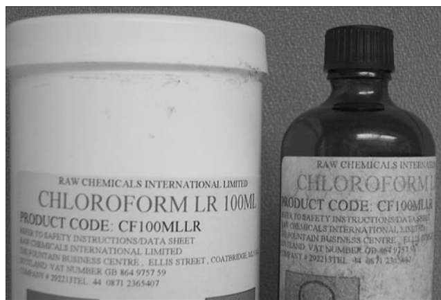
Fig. 1 A half-empty bottle of chloroform

of the highest reported serum chloroform levels in a survivor.