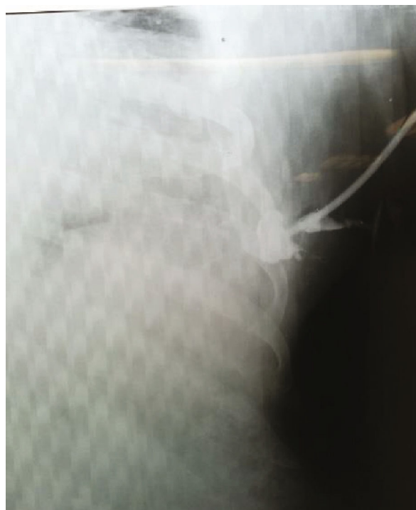
FIGURE 1: Fistulography of chronic draining sinus.

Early SSI can trigger life-threatening bleeding or pseudoaneurysm formation [11]. Cutaneous-pericardial fistula after TA-TAVR can emerge as a late manifestation of the SSI. In most cases, it is a hospital-acquired infection and is classified as space/organ SSI according to the Centers for Disease Control criteria. To our knowledge, only 11 cases were reported in the literature (Table 1) [10, 12–15]. The mean age in the retrieved series was 80.4 \pm 7.09 and the mean time from TAVR to the presentation was 5.4 months. In our case, the patient was much younger but with a lot of comorbidities, and the onset of clinical manifestation is included by the general trend.