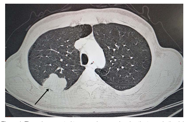
Figure 1. Thoracic computed tomography scan showing the tumor in the right apical superior lobe (arrow).

The esogastroduodenal fibroscopy showed no evidence of bleeding. A total colonoscopy showed melena in the colon but failed to reveal the bleeding site.