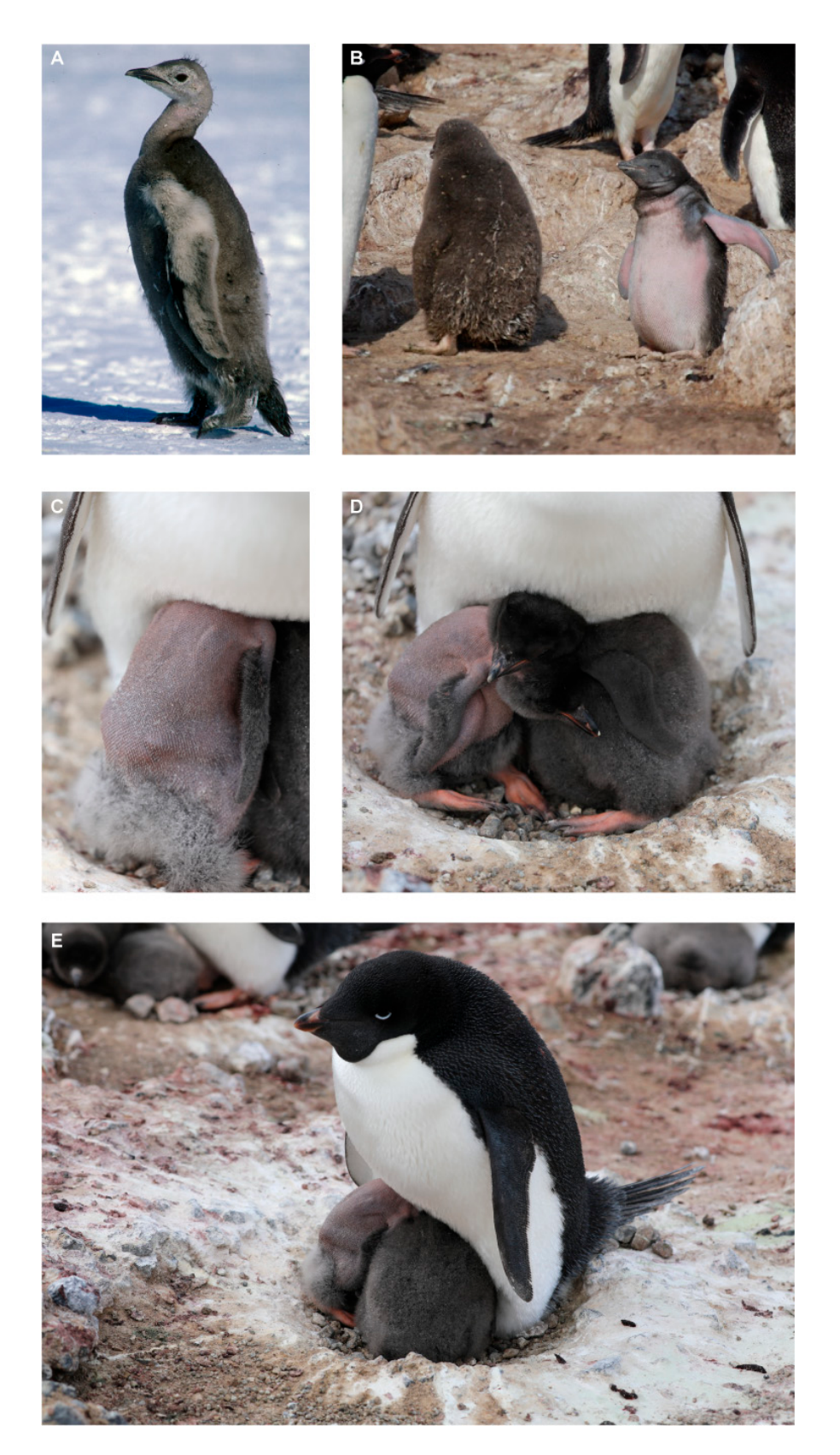
Figure 1. ( A ) Emperor penguin chick with feather-loss disorder (1996) at Cape Washington, northern Victoria Land, and in southern Victoria Land, Ross Island; ( B ) Adélie penguin chick with feather-loss disorder at Cape Royds, southern Victoria Land (2011–2012 breeding season); ( C ) Adélie penguin chick with feather-loss disorder at Cape Crozier (2018–2019 breeding season); ( D ) Adélie penguin chick affected by feather-loss disorder (2018–2019 breeding season) on a nest at Cape Crozier with fully feathered sibling; and ( E ) an asymptomatic parent.