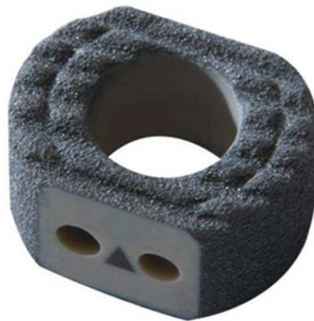
Figure 1. The CeSpace XP® Titanium-coated PEEK cage.

The statistical evaluation was performed using SAS Software version 9.4 (SAS Institute Inc., Cary, NC, USA). Statistical analysis of age and gender was performed by Student's t-test. A p-value <0.05 was deemed as statistically significant.