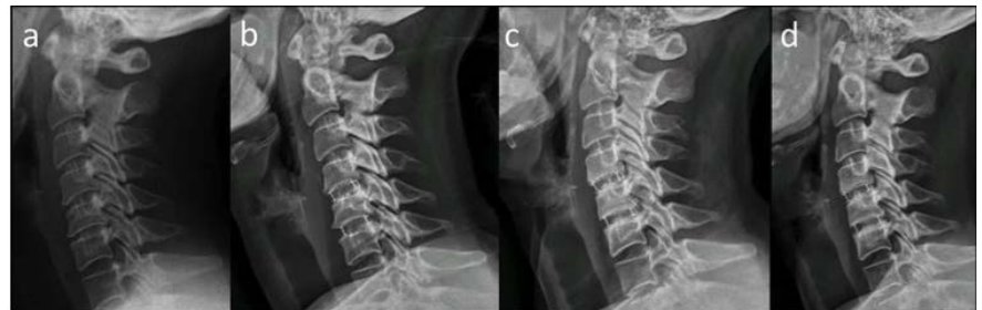
Figure 2. Patient with a bisegmental fusion: a) preoperatively, b) directly postoperative, c) after 5,5 months, and d) after 12 months.

We present a prospective study that intended to re-examine patients being operated for ACDF with cervical stand-alone TTN-coated PEEK cages in the past. The purpose of this investigation was to get more information on the clinical and radio-