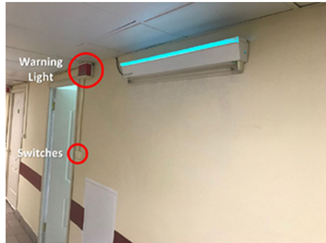
Figure 3. Multi-use UV-C fixture is shown in a hallway adjacent to a patient room along with the two-function switch for operation of: (a) the upper louvered, UVGI lamp for upper-room UVGI and is operated 24/7, including when occupied; and, the lower, an unshielded UVGI lamp for whole-room UVGI

A trained technician uses a Gigahertz-Optik X9 11μ UV-C meter with a UV-3718-4 detector (Gigahertz-Optik, GmbH, Türkenfeld, Germany) for monitoring UV-C fixture performance for both air disinfection effectiveness and safety for occupants in lower-room space. Based on lamp depreciation measurements made during the first few years of operation, we found that the measured UVGI level of 254 nm in the air treatment zone at 1m should exceed 250 \mu\text{W cm}^{-2} with less than 1% reduction in 168 h. In addition, UVGI measurements were taken at standing eye height (1.65 m) as well as other locations throughout the space to ensure the irradiance was no more 0.1 \mu\text{W cm}^{-2} , the current Russian regulation. These assessments were performed every six months and dutifully recorded. Lamp replacement is based on the biannual UVGI measurement at 1 m distance from the UV-C fixture in the upper-room. Maintenance