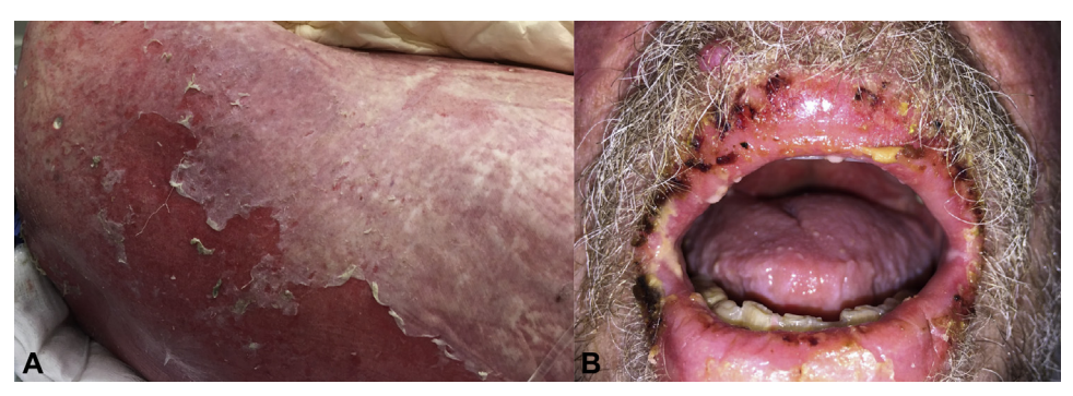
Fig 1. A , Erythroderma with widespread and confluent epidermal detachment resembles toxic epidermal necrolysis. B , Severe mucositis including erosive cheilitis with hemorrhagic crust was also present.