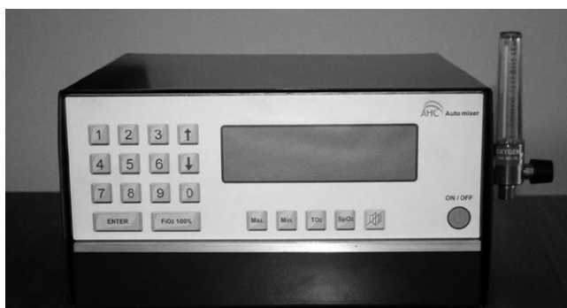
Figure 1 The Auto-Mixer.

The Auto-Mixer ® algorithm was designed to continuously sense, monitor and process the infant's SpO 2 signal