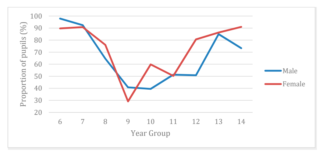
Figure 2. Proportion of males and females not achieving the recommended amount of physical education per year group.

At post-primary school level, 40.2% of participants achieved the PE guidelines; however, the proportion varied across year groups and gender (Figure 2). Males were also more likely than females to achieve the recommended 120 min per week of PE (45% vs. 34.3%), x^2 (1, n = 1417) = 16.59, p < 0.001, phi = -0.110. Schools with lower %FSM were significantly more likely to meet PE recommendations than those with higher %FSM (40.2% vs. 20.8%, p < 0.001).