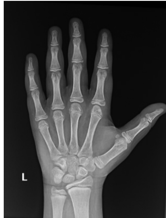
Figure 2 Follow-up bone age with improvement in sclerosis and fraying after levothyroxine treatment.

chondrocytes that secrete matrix proteins and growth factors to regulate cartilage vascular invasion and mineralization by osteoblasts (2). Thyroid hormone receptors are expressed in growth plate chondrocytes, osteoblasts, and osteoclasts (2). Additionally, triiodothyronine (T3) promotes hypertrophic chondrocyte differentiation and cell volume expansion needed for mineralization (3). Poor mineralization has previously been described in individuals with congenital hypothyroidism who are born with low thyroid levels, and prolonged untreated hypothyroidism can lead to irregular epiphyseal appearance known as stippled epiphyseal dysgenesis and is more often to be found in large cartilaginous centers such as the head of the femur or humerus (4, 5, 6). In adults, abnormal thyroid levels are known to cause poor bone mineralization and increased risk of fractures (2). Since rickets is caused by poor mineralization of the endochondral matrix, rickets can theoretically occur in a growing child with prolonged acquired hypothyroidism but is not typically seen in practice.