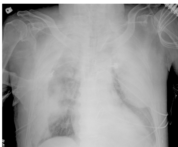
Fig. 2 Post-operative chest plain film showing the progression of the right extrapleural hematoma. A newly developed left extrapleural hematoma was noted

Salim et al. previously described a left side unilateral hemothorax in a 46-year-old South Indian male due to a giant arteriovenous (AV) hemodialysis fistula in the left forearm. The patient had enlarged artificial AV fistula without evidence of thrombosis or stenosis. Intercostal drainage was performed. After ligation of AV fistula, pleural effusion decreased and the patient was discharged after three days [4]. The high venous flow through the AV fistula caused an increase in venous pressure stenosis and/or thrombosis of the brachiocephalic and/or subclavian veins. Stenosis of the brachiocephalic vein in association with high venous flow rates can increase venous pressure in the intercostals and bronchial veins of the chest, which in turn could alter local hemodynamics. As pleural fluid resorption is poor in normal conditions, excess pleural fluid formation is expected to occur, leading to unilateral pleural effusion on the same side as that of vein stenosis/thrombosis [5]. Therefore, the hematoma collected in the extrapleural space instead of the pleural one is putative because of a previous pleuritis with fusion of the two pleuric layers. The possibility of unilateral spontaneous EPH due to high venous flow through the AV fistula should therefore be considered in this particular situation. In