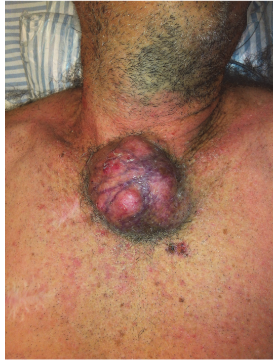
FIGURE 1: Nonmelanoma Skin cancer on sternal region, invading ribs, clavicles, and manubrium sterni.

The histopathological data confirmed advanced disease, with lesions deeper than 4 cm, invasion of pectoralis muscle