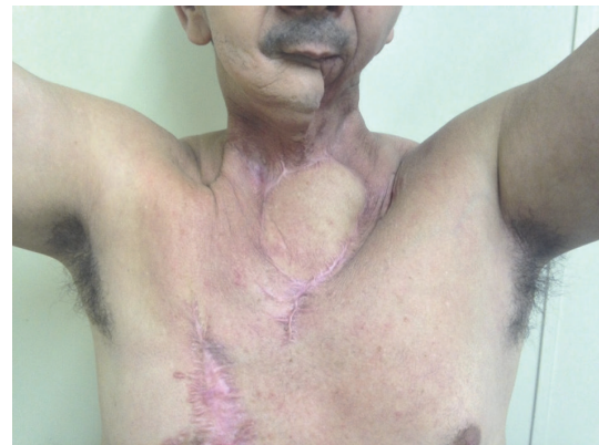
FIGURE 3: Functional preservation of the upper limbs after extended sternectomy and reconstruction with myocutaneous flap.

estimates of incidence rates and expected numbers of new cases in relation to this cancer should be considered as minimum estimates [3, 4]. According to Brazilian National Cancer Institute, it is estimated that there will be 85.170 and 80.410 new cases of nonmelanoma skin cancer in men and women annually, respectively, by 2018 and 2019 in Brazil [3, 4]. Skin squamous cell carcinoma is the second most prevalent type, after the basal cell type. Solar radiation exposure is the main risk factor for SSCC and BCC, both more prevalent in tropical regions: 75% occur in areas around the face and neck, in fair-skinned and older people [5]. In Ceara state, in the northeast