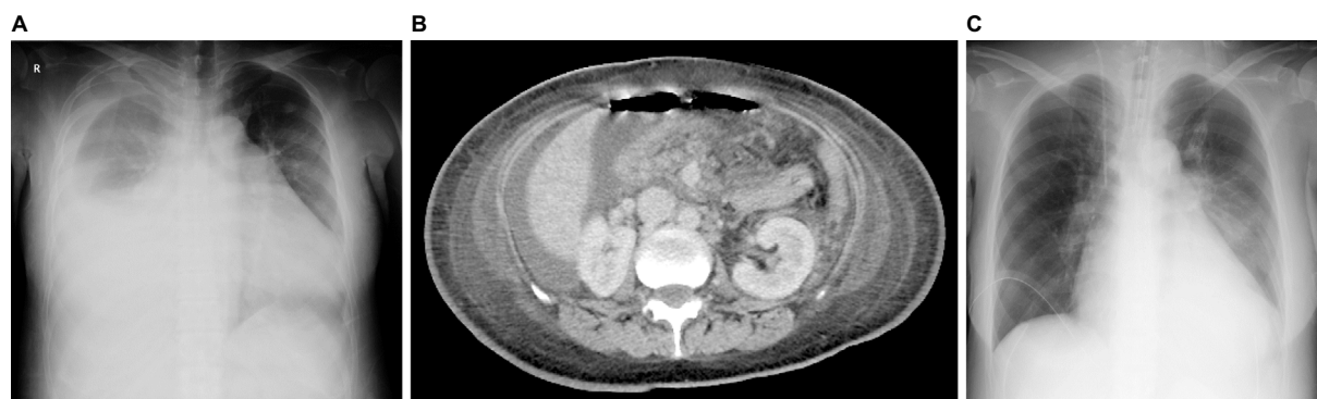
Figure 2. Chest X-rays films and contrast-enhanced computed tomography. (A) The chest X-ray on presentation to previous hospital showed marked cardiomegaly with bilateral pleural effusions that were larger on the right side. (B) Contrast-enhanced computed tomography on presentation to the previous hospital (before surgery) revealed free air in the peritoneal cavity with edematous duodenum and ascites. (C) The chest X-ray on discharge from the intensive care unit showed a marked improvement of heart failure.