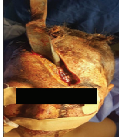
Figure 1: Preoperative picture showing the large metallic hook penetrating the patient's forehead.