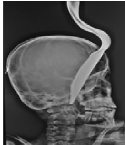
Figure 2: Oblique plain skull radiograph showing the extension of the metallic object penetration.

specialized pediatric hospital for further ophthalmology and neurocognitive assessment.