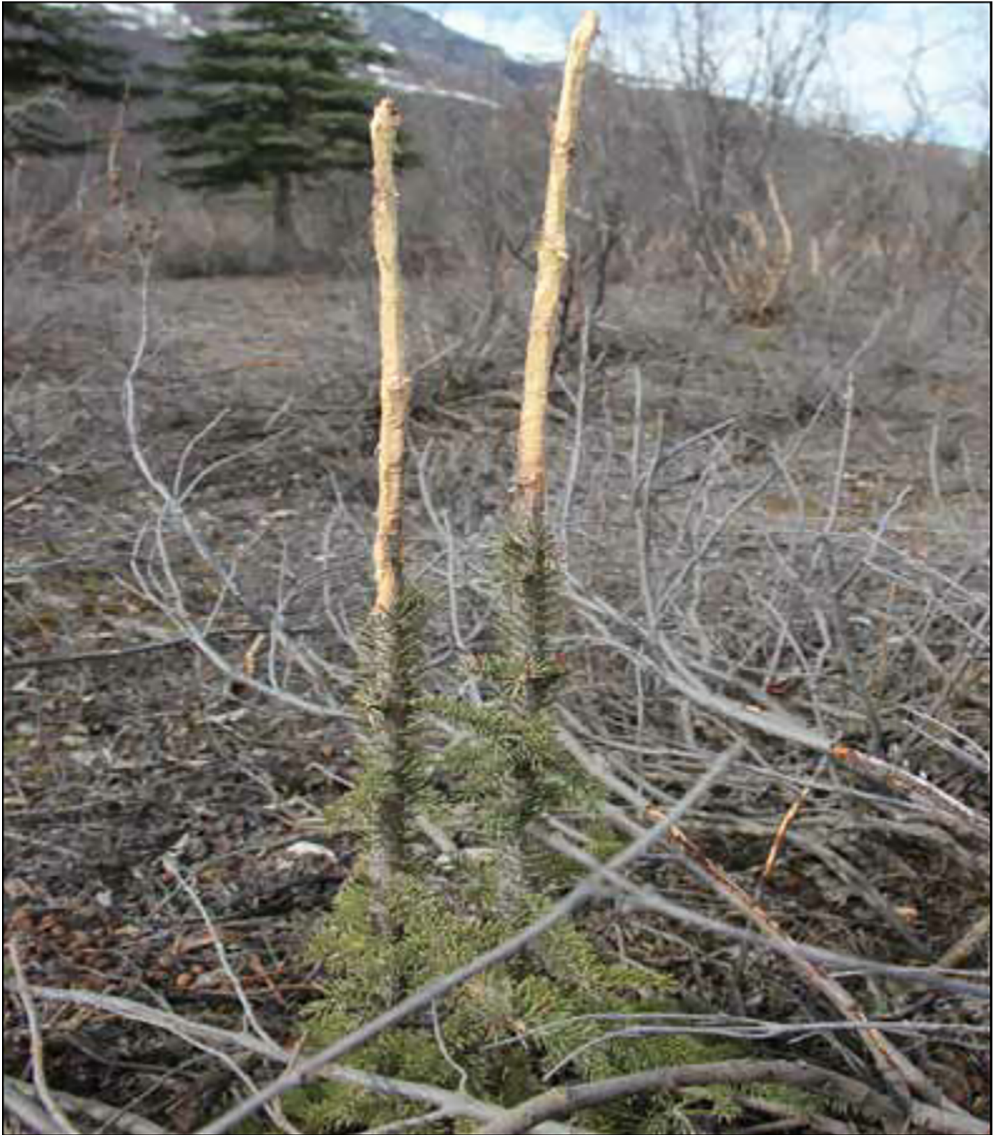
Fig 3. An unknown is the missing record of spruce that die because of hare browsing, as exemplified in the photograph of individuals likely to soon die by browsing hares at Koyukuk.

https://doi.org/10.1371/journal.pone.0198453.g003