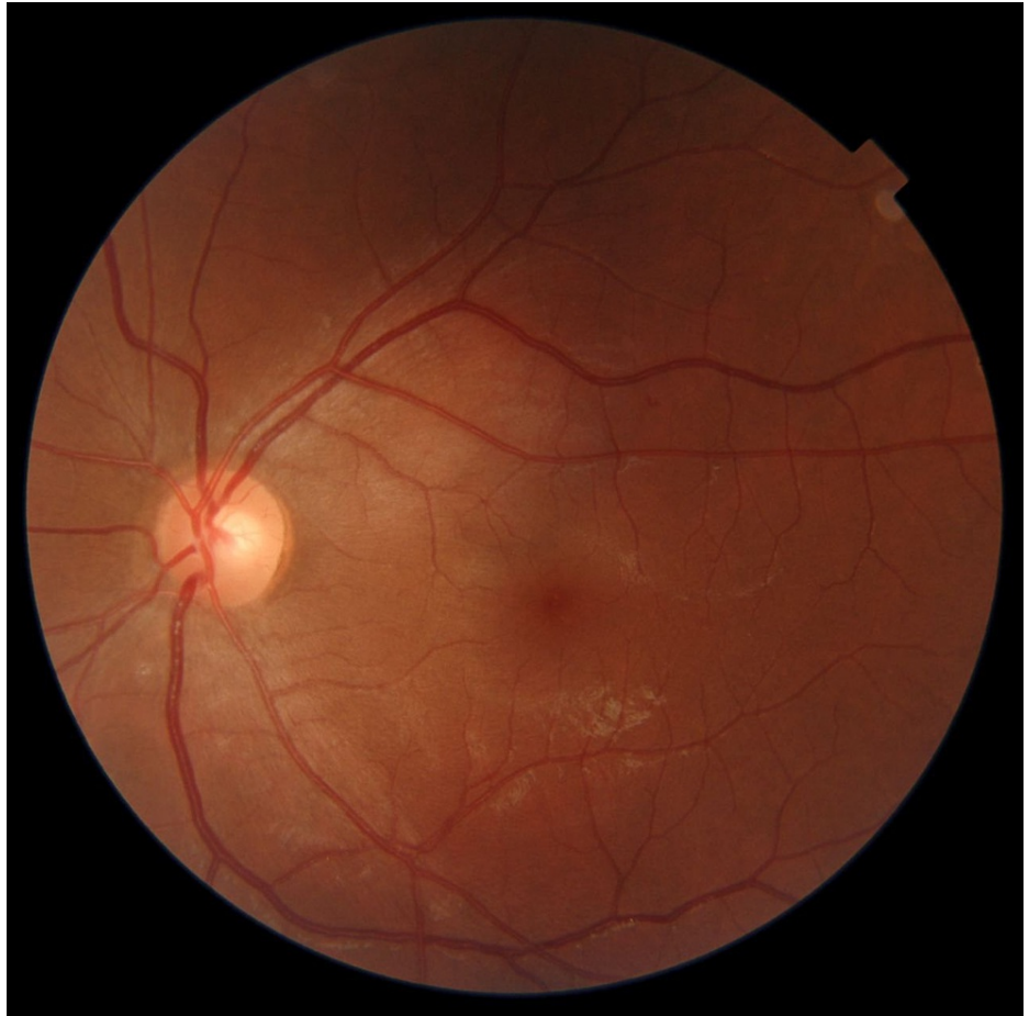
FIGURE 1: Color fundus photography shows no abnormal finding.