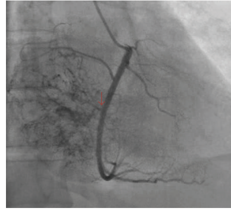
FIGURE 2: Angiogram demonstrating perfusion to the mass by a dense network of neovasculature arising from the mid right coronary artery.

While the skin is the most common location of a primary lesion, malignant melanomas can also be found on the mucous membranes, upper esophagus, anus, eyes, or meninges. In the present study, no primary sites were identified; rather, metastatic melanoma was diagnosed by the presence of lesions incidentally discovered on the liver and heart. While primary tumors of the heart are rare, melanomas