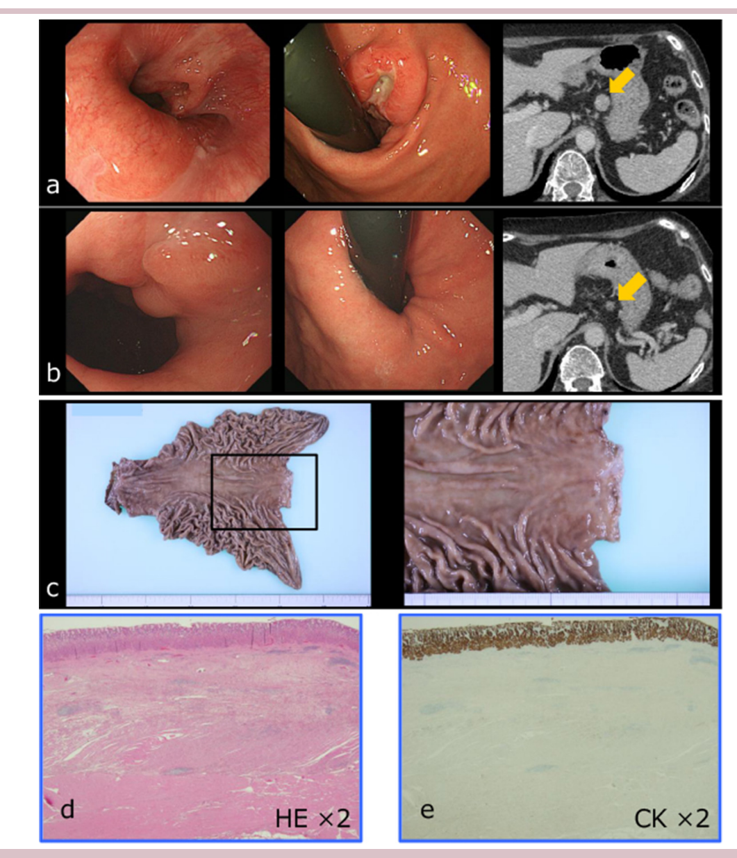
Figure 3 Pathological complete response case. (a) Pretreatment findings; (b) after two courses of neo G-SOX; (c) surgically extracted specimen after neo G-SOX; (d) haematoxylin--eosin (HE) staining of the resected specimen; and (e)cytokeratin (CK) staining of the resected specimen. G-SOX, S-1 plus oxaliplatin for advanced gastric cancer.

specific scale for neurotoxicity-related QoL, showed that sensory neuropathy caused a deterioration in QoL immediately after the initiation of neo G-SOX, but that QoL recovered after the neoadjuvant chemotherapy.