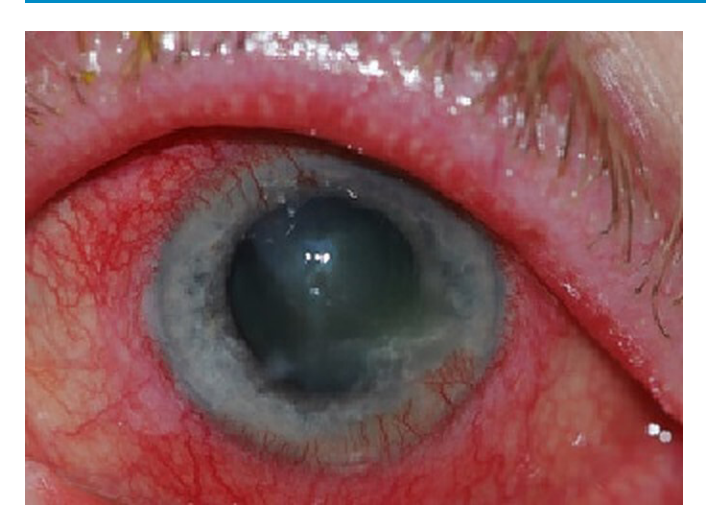
Figure 1 The patient's clinical appearance 1 week after beginning topical treatment. The eye is significantly inflamed, with corneal neovascularisation, epithelial defect and stromal opacity. The pupil is pharmacologically dilated.

can lead to recurrent clinical disease; this can include corneal infection, as in our patient.