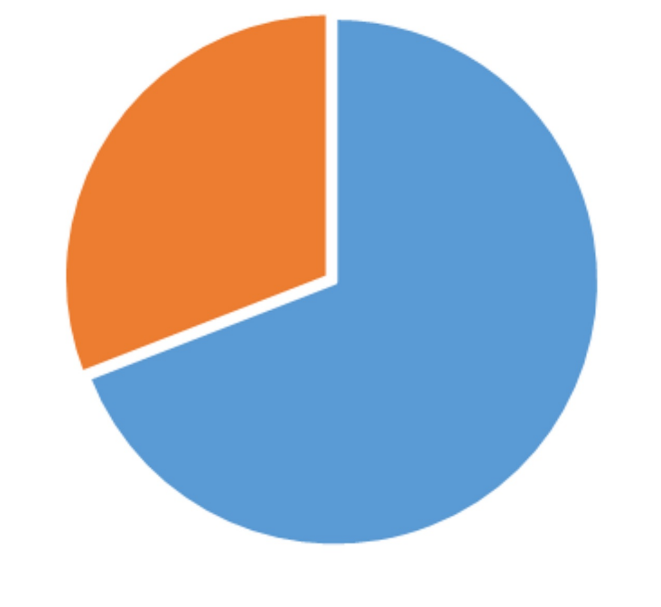
Diagnosis of Anorexia Nervosa