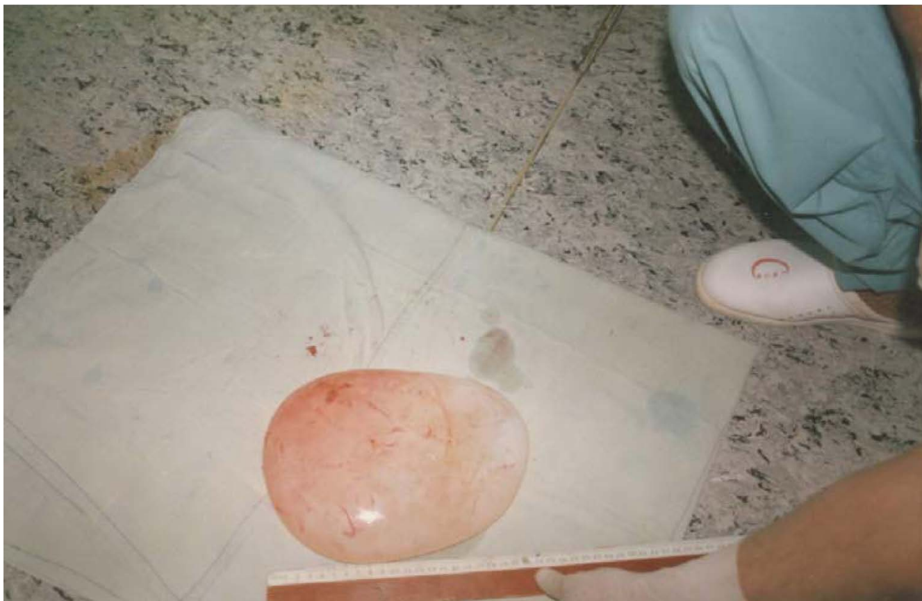
Figure 3 The delivered, very large, lung white cyst (giant hydatid cyst) with the greatest diameter measuring 26 cm.