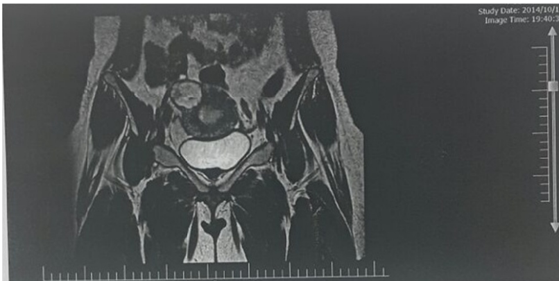
Fig. 1. Sagittal view of pelvic MRI