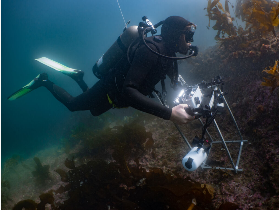
Figure 2. doi

18 mm setting, autofocus, ISO 400, Exposure 1/200 s at f/11 and flashes set on automatic TTL. A dive computer (Oceanic Geo2) was mounted on one side of the quadrat to register the depth and temperature of each photoquadrat. Divers carried a monofilament line that towed a surface buoy with a GPS logging a waypoint every 3 seconds (Bravo et al. 2021).