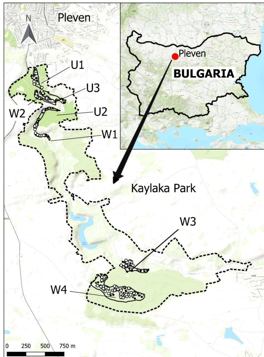
Figure 1. Location of the Kaylaka Park and sampling sites urban (U1–U3) and wild (W1–W4) in Bulgaria. The boundaries of the Kaylaka Park protected area are represented by a dotted line. All sample collection areas are represented by a solid line. Each collected tick is marked with a dark circle. Ticks that are positive for Borrelia are represented by a white circle.

The second type of site was natural (wild) and included four areas in the park further from the city (W1–W4). The second category included semi-natural woodland areas with natural and managed forests and low-transformed settlement foci, more rarely visited by people. It is known that they are permanently inhabited by large mammals, including a free-living population of roe deer ( Capreolus capreolus ), wild boar ( Sus scrofa ), foxes ( Vulpes vulpes ), European badger ( Meles meles ), and jackals ( Canis aureus ). Large numbers of rodents, insectivores, birds, and reptiles are also common (personal observation) [25]. These areas are mainly visited by forestry workers, tourists, collectors of herbs, or mushroom pickers during specific periods of the year. Information on the sampling areas has been described in a previous study [23].