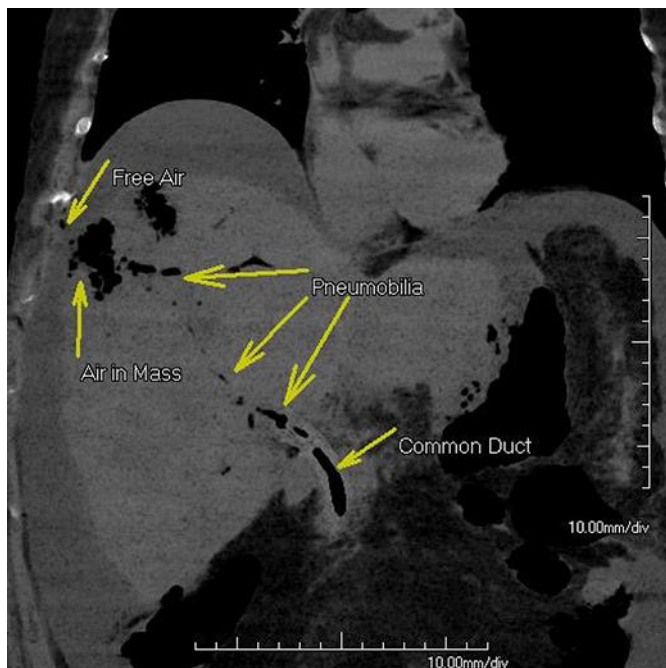
Fig. 2. Coronal view showing pneumobilia with air in mass and adjacent free air.