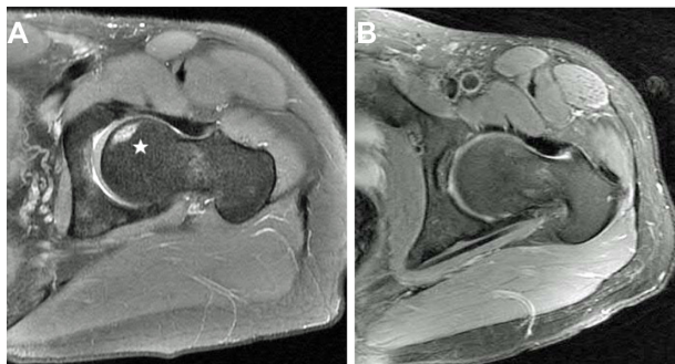
Figure 2 Preoperative magnetic resonance image (A) from a patient with an avascular necrosis lesion at the femoral head (star). The patient underwent minimally invasive core decompression with injection of autologous concentrated bone marrow aspirate and noted a significant reduction and pain. Follow-up magnetic resonance imaging 2 years following decompression and concentrated bone marrow injection showed complete resolution of the avascular necrosis lesion (B).