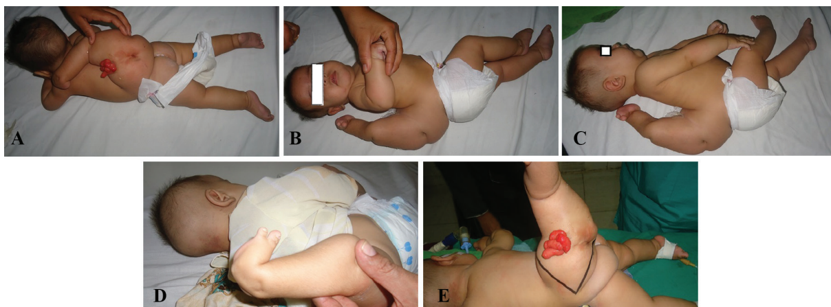
Fig. 1: A-E: The accessory lower limb was arising from the lower back at the level of L2 to S1. It was pointing cranially. Grossly, it resembled a normal lower limb with a partially developed foot containing only big toe and the next adjacent toe. The accessory limb was bearing four blind ending gut loops of red color. These used to wet the clothing with their watery secretion. Additionally, there were areas with pitting and dimples, mimicking the natal cleft and anus.

The CT scan findings of the accessory lower limb were also re-confirmed. The cranial magnetic resonance was normal with no associated cerebral anomalies found. Written