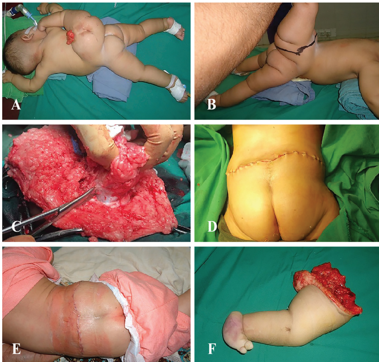
Fig. 3: A: The infant was positioned prone on the operating room table for undertaking surgery. B: An elliptical skin incision with transverse orientation was designed to ensure adequate closure of the resultant defect after limb extirpation. C: The neural placard was carefully dissected, de-tethered from attachments and returned. Dural closure was performed. The overlying dorsolumbar fascia was closed. D: The skin was closed with subcuticular absorbable sutures. Steristrips were applied to support the wound. E: The wound was perfectly fine on the first dressing change on 5 th postoperative day, after removal of steristrips. F: The ablated accessory limb.