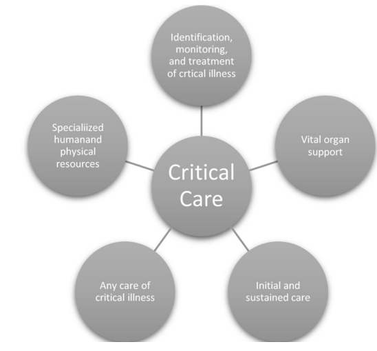
Figure 3 The defining attributes of critical care.

Many hospitals have wards or units for the provision of critical care, such as emergency units, high dependency units or ICUs.<sup>22</sup> Critical care can also be provided in general wards, and a recent global consensus specified the care that should be included for all patients with critical illness in any hospital location.<sup>23</sup> Rapid Response Teams