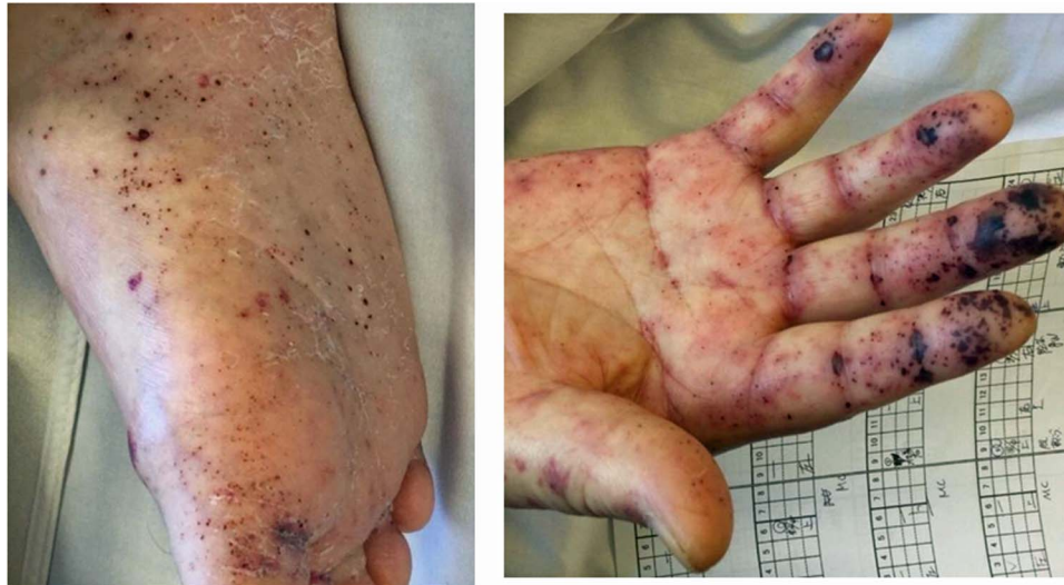
Figure 1: Skin findings on Day 10; worsening of purpura was observed on both the hands, lower legs, soles and dorsum pedis.