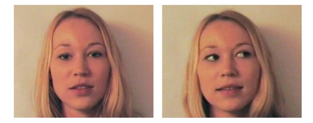
Figure 1. Illustration of the stimuli used in the Experiment: brown and blonde-haired faces with direct or averted gaze. doi:10.1371/journal.pone.0018610.g001