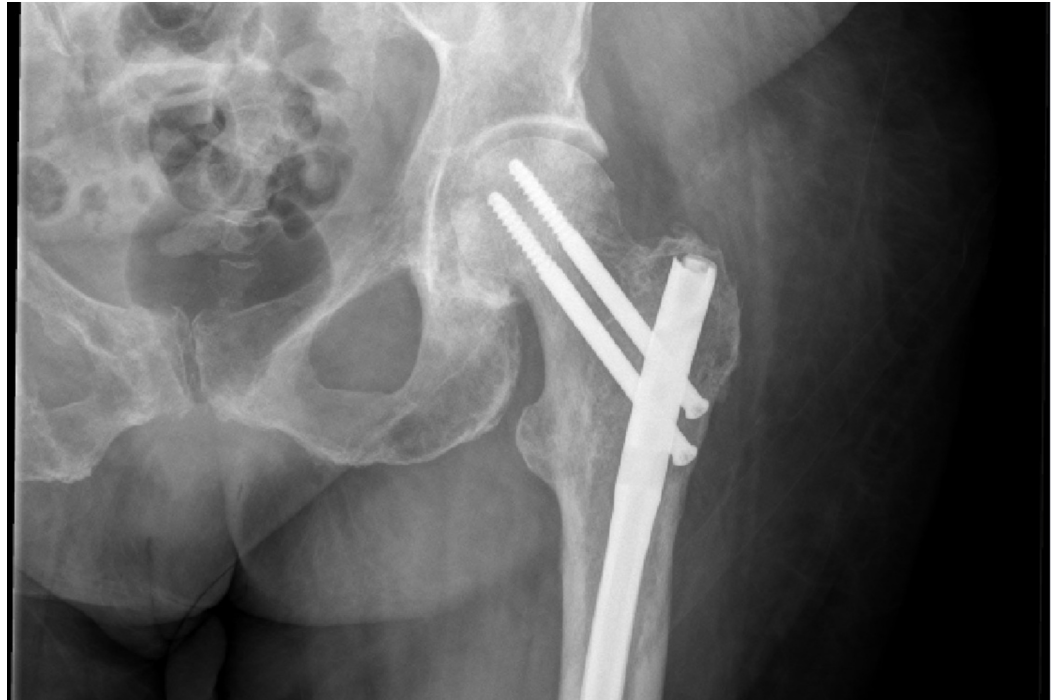
FIGURE 5: Postoperative left femur

Then, two days later, with a Mirels' score of 8, she underwent prophylactic left femoral IMN fixation. Postoperative films showed anatomic alignment (Figure 5). Following the procedure, she was neurovascularly intact throughout her left lower extremity. On postoperative Day 3 from the left IMN fixation, she was discharged from the orthopedic service.