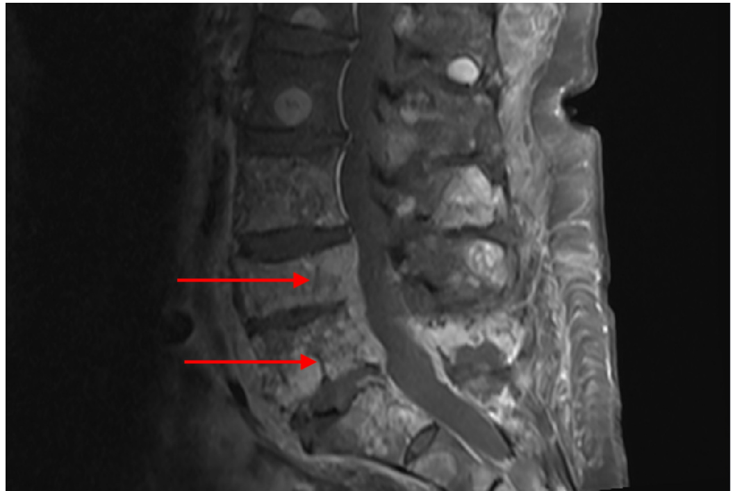
FIGURE 6: Vertebral compression fractures

Severe extensive metastatic disease with pathologic compression fractures of L4 and L5 (arrows) and extensive epidural tumor invasion at L4 and L5 with foraminal neuronal encroachment.