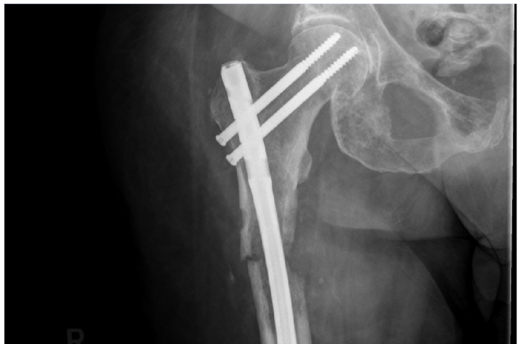
FIGURE 4: Postoperative right femur

The following day, the patient underwent right femoral IMN fixation using a 12 mm x 420 mm titanium cannulated nail. Thereafter, she was neurovascularly intact throughout her right lower extremity and postoperative films showed anatomic alignment (Figure 4).