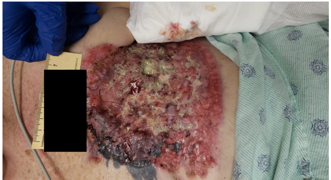
FIGURE 3: Left chest wall mass

There was no identifiable fracture on the left side. Further examination exposed a necrotic, fungating left chest wall mass (Figure 3), with left axillary lymphadenopathy suggestive of metastatic breast disease.