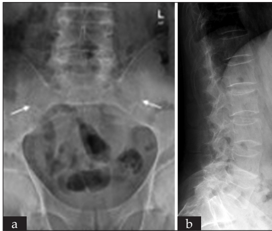
Figure 1: (a) Stage IV sacroiliitis. (b) Apophyseal joints involvement without vertebral squaring and bamboo spine

Treatment with oral prednisolone (15 mg/day), sulfasalazine (2 g/day), acemetacin (120 mg/day), and colchicine (1.5 mg/day) was commenced. After 10 days of the treatment the skin eruptions completely disappeared, arthritis and low back pain substantially subsided.