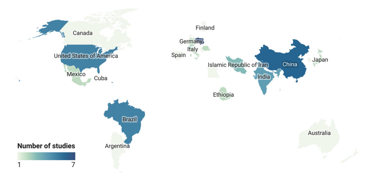
Created with Datawrapper