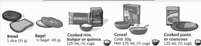
Figure 2 COMPASS questionnaire eating behaviour measures. Images from Canada's Food Guide. Health Canada, 2011. Reproduced with the permission of the Minister of Health, 2011.

data were missing from 30.9% of females (n = 29) and 11.9% of males (n = 10).