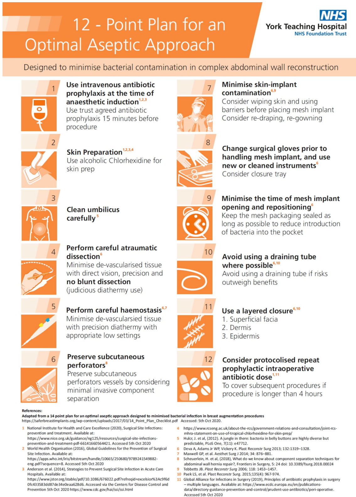
Fig. 3 The 12-point plan to minimise surgical site infection (SSI) in CAWR