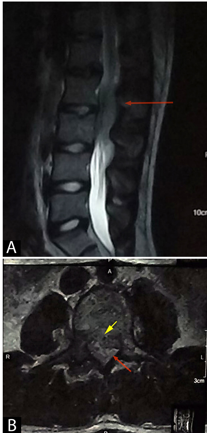
FIGURE 1: T2 sagittal (A) and axial (B) images showing a heterogeneous iso- to hyper-intense lesion extending from the L2 to L3 vertebral level, causing severe central spinal canal stenosis compressing the thecal sac (red arrows). A suspicious breach in the posterior cortex of the vertebral body is also noted (yellow arrow). Disc spaces between the L2 and L3 vertebral body appear intact. Prevertebral regions appear normal.

and iso- to hyper-intense on T2, with severe spinal stenosis at L2-L3 vertebral level (Figure 1).