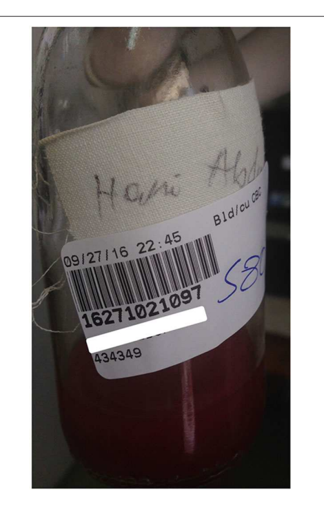
FIGURE 2 Photo illustrating several recurrent challenges in the pre-analytic phase of testing. A few mL of blood (i.e., inadequate volume) in a manual culture bottle (inappropriate collection device) without a requisition or any way to identify the requesting physician. The patient is identified only by name, without a unique identifier. The barcode shown was generated in the laboratory after a time-consuming investigation conclusively identified the patient and a requesting physician.

A number of serious and sometimes perplexing obstacles in the post-analytic threatened the pertinence of our laboratorystrengthening intervention ( Table 3 ). These included the absence of a functioning telephone, electronic medical record, or functional result printing service for the bacteriology sector. This made it difficult to report legible and clear bacteriology results to ordering physicians in a timely manner. At TASH, results are most frequently entered manually on the test requisition by the technologists, and placed in a folder that treating teams could collect. Further results are then copied in a laboratory log book which clinicians can consult on site. Prior to this intervention, no means of communicating urgent results such as positive blood cultures was available. We successfully implemented a policy of demanding the mobile phone number of the ordering physician