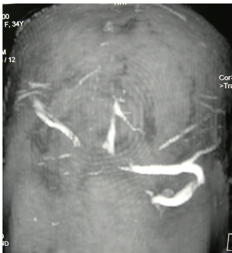
Figure 2 Magnetic resonance venography showing absence of signal of part of right transverse sinus and superior sagittal sinus.

The mode of onset is highly variable, which can be from sudden to progressive over weeks, so it can mimic other conditions such as tumor, stroke, or benign intracranial hypertension. Headache, focal deficits, seizures, disorders of consciousness, and papilledema, which can present in isolation or in association, are the most frequent signs [6,7]. Diplopia is not a common presenting symptom of cerebral venous sinus thrombosis [8]. If the intracranial pressure is quite high, a sixth cranial nerve palsy may develop. Usually it presents as a false localizing sign, but it may also indicate extension of thrombus into the inferior petrosal sinus [9].