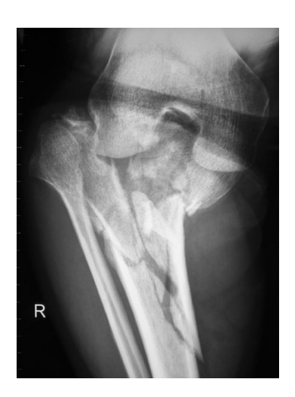
Fig. 1 52-year-old female with bicondylar tibial plateau fracture

Host staging for comorbid issues included systemic factors such as HIV infection and CD_4 count as well as any chronic medical conditions. HIV infection was found in seven patients (15 %) with CD_4 counts ranging from 309 to 612 cells/mm<sup>3</sup> (median = 352 cells/mm<sup>3</sup>, SD 104.9). There were two diabetic patients, and six patients were smokers (Table 2). Local staging included classifying the soft tissue injuries according to the Gustilo–Anderson classification for open fractures and the Tscherne and Goetzen classification for closed fractures [20, 21]. There were plain X-rays and CT scans for all patients (Fig. 1). Fractures were classified according to the Schatzker classification [22]. Most of the patients sustained Schatzker type-VI fractures (n = 36) with the remainder being Schatzker type-V fractures (n = 10).