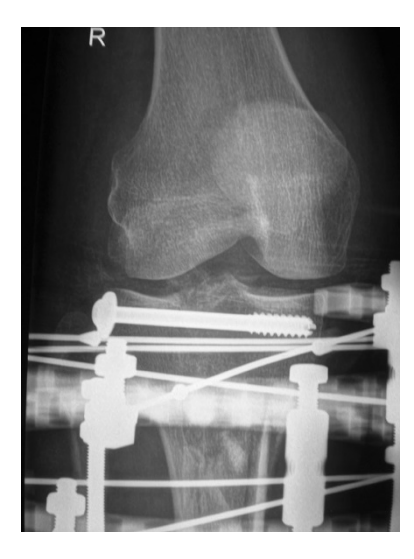
Fig. 3 Post-operative radiograph showing limited internal fixation and circular external fixator

The surgical technique included closed reduction or limited open reduction through a 2-cm longitudinal midline incision. Fluoroscopy-guided reduction of the articular surface was performed via this incision and of any metadiaphyseal fracture lines. If fracture lines were not present or inadequate to allow insertion of instruments for reduction in articular fragments, a cortical window was created. After articular surface elevation, the resulting metaphyseal defect was grafted with iliac crest autograft. Due to the extensive articular comminution that was sometimes seen, anatomical joint reduction was not always possible.