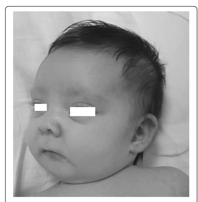
Fig. 2 Dysmorphic facial features suggestive of Kabuki syndrome

Piro et al. Italian Journal of Pediatrics (2020) 46:136 Page 4 of 7