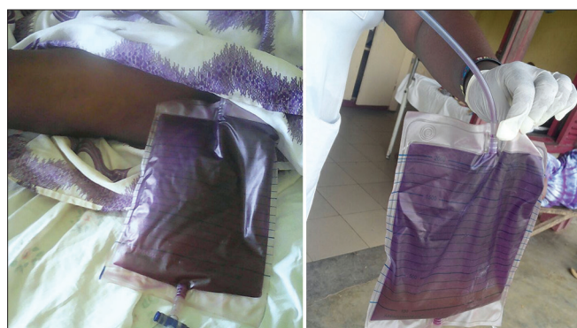
Figure 1: Purple discoloration of plastic urine bag and tube

The authors certify that they have obtained all appropriate patient consent forms. In the form the patient has/have given his/her/their consent for his/her/their images and other clinical information to be reported in the journal. The patient understand that their names and initials will not be published and due efforts will be made to conceal their identity, but anonymity cannot be guaranteed.