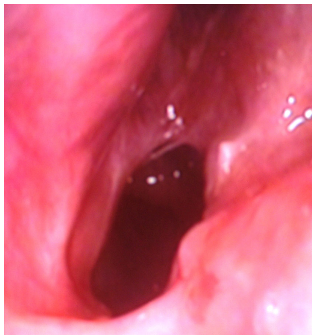
Figure 3 Right choanal opening 12 months after surgery.

Yasar and Ozkul [6], reported a 51-year-old patient with bilateral choanal atresia. Using a transnasal endoscopic